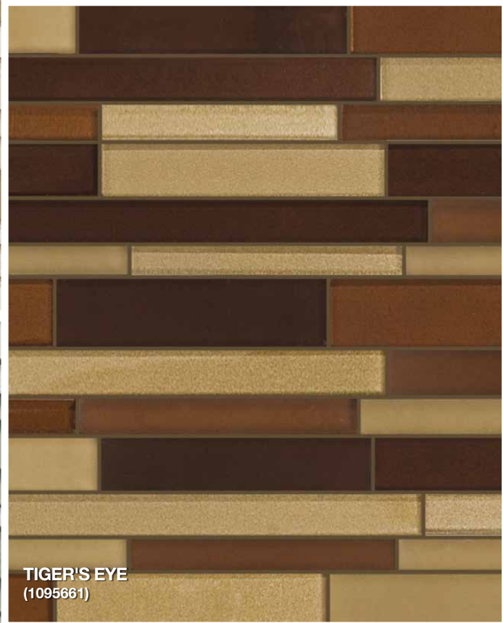
TIGER'S EYE (1095661)