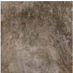
1093264 - 18"x18"