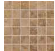
1093170 2"x2" Mosaic (12"x12")