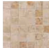
1093169 2"x2" Mosaic (12"x12")