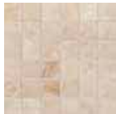
1093348 2"x2" Mosaic (12"x12")