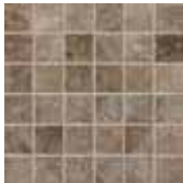
1093278 2"x2" Mosaic (12"x12")