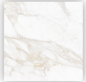
Calacatta Oro 32" x 32" MASORO3232