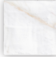
Calacatta Oro 6" x 6" MASOROWALL66