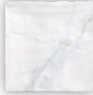
Carrara 3" x 6" MASCARWALL66