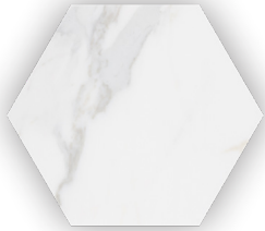
Carrara 9" x 10" Hexagon MASCARHEX