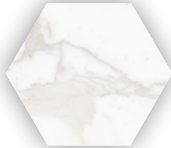
Calacatta Oro 9" x 10" Hexagon MASOROHEX