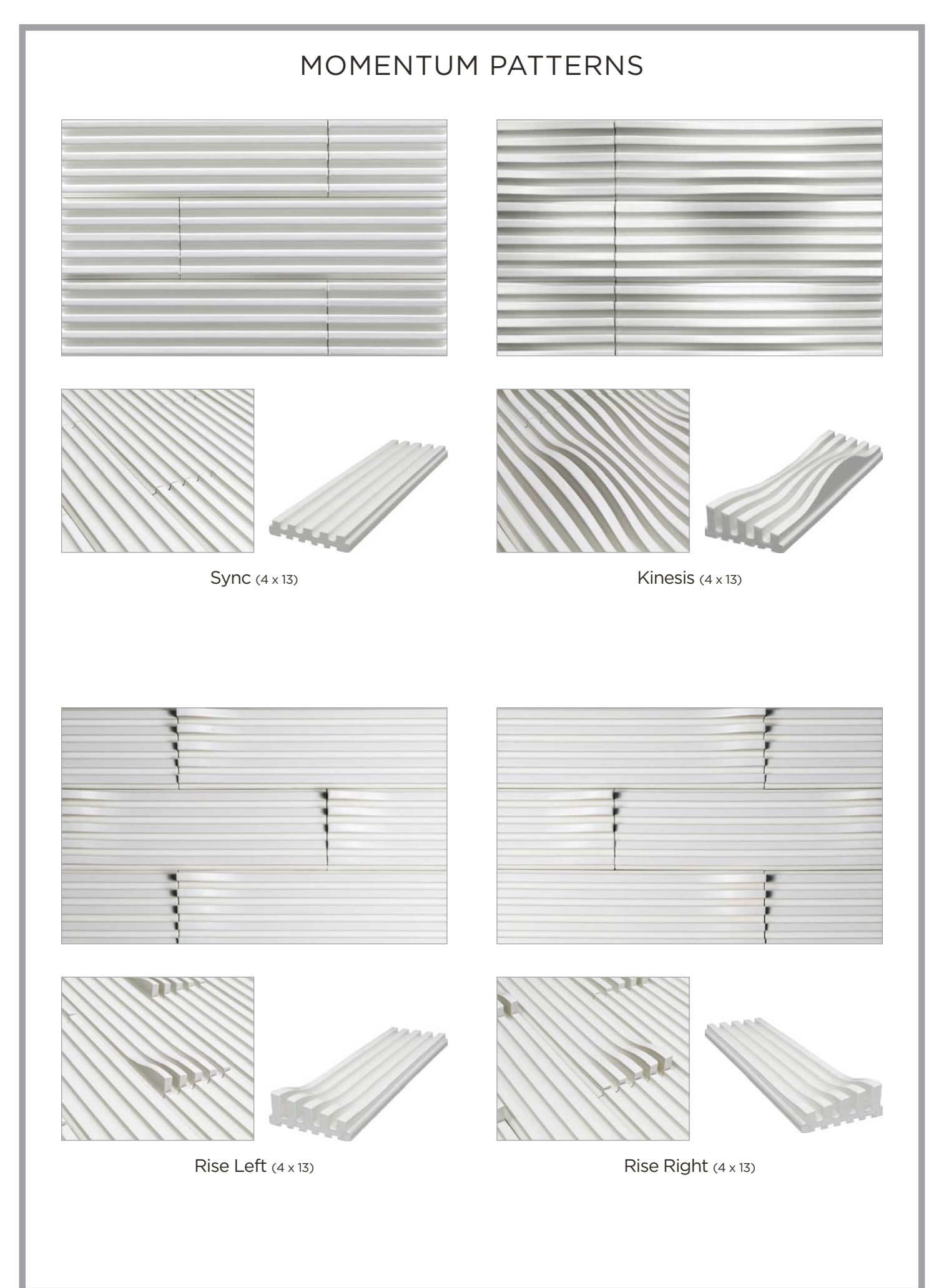
Material Thickness: Dimensional (see website for details) • Color Shown: White Sand