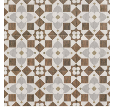
Laguna 8" x 8" x 3/8" IFS8X8PL