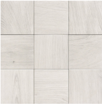
Birch 8" x 8" x 3/8" IFS8X8PB