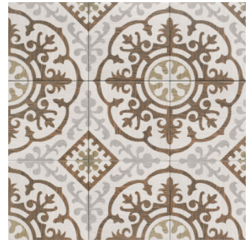
Ojai 8" x 8" x 3/8" IFS8X8PO