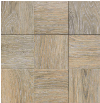
Pine 8" x 8" x 3/8" IFS8X8PP