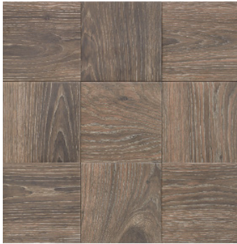
Chestnut 8" x 8" x 3/8" IFS8X8PCN