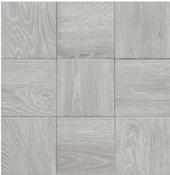
Driftwood 8" x 8" x 3/8" IFS8X8PD