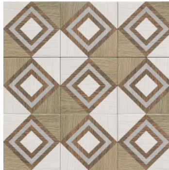
Lodi 8" x 8" x 3/8" IFS8X8PLO