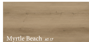
Myrtle Beach AT17