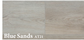
Blue Sands AT21