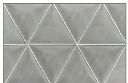
Light Gray IFS4X5PLG