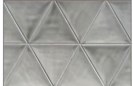
Dark Grey IFS4X5PDG