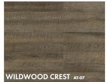
WILDWOOD CREST AT-07