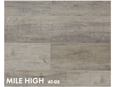
MILE HIGH AT-02