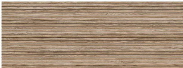
Oak 18" x 48" x 5/16" IFS1848WO

MLW gets on board with the wood panelling trend by presenting the white body Woodridge model in 18x48" format, which recreates the look of wooden slats. The collection is available in oak, ash and cypress tones. Moreover, it is an ideal complement to any other series, since it can be installed on an entire wall, or just a section of it to create baseboards, headboards or cozy nooks.