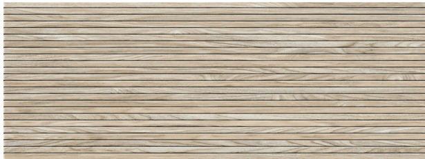
Cypress 18" x 48" x 5/16" IFS1848WC