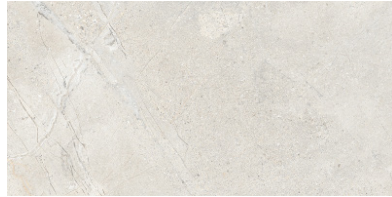
Sediment Light Gray 24x48 24" x 48" x 5/16" IF02448SLG