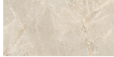
Sediment Beige 24x48 24" x 48" x 5/16" IF02448SB