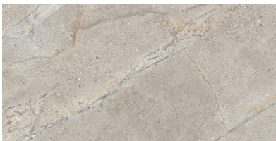
Sediment Taupe 24x48 24" x 48" x 5/16" IF02448ST