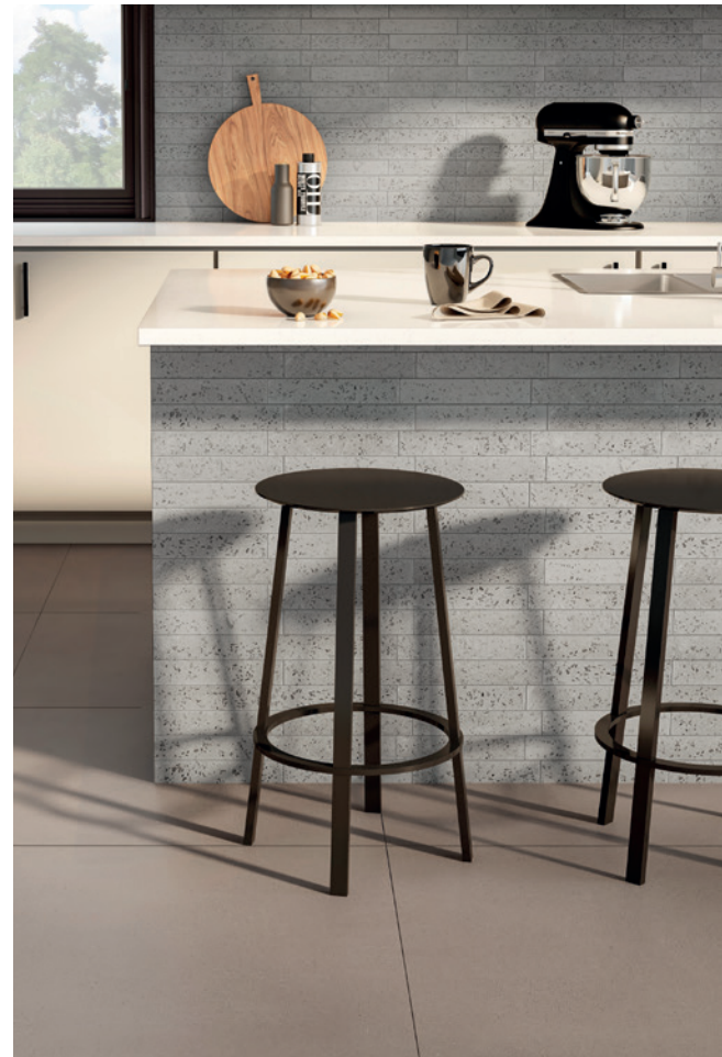
Cement Block Smoke | Artisan Brick Smoke