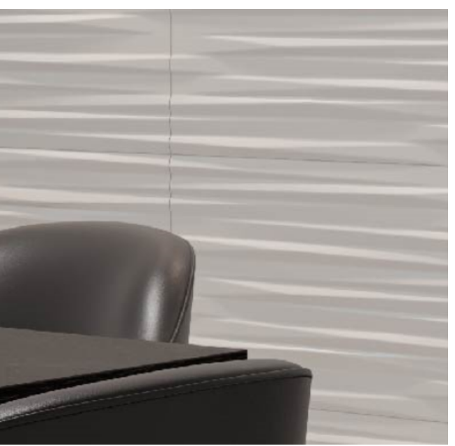
Wind White 16"x48" R

The Wind series presents longitudinal reliefs at different heights, inspired by the dynamics of the wind. Available in a white matte finish, it brings sophistication to projects of any style.