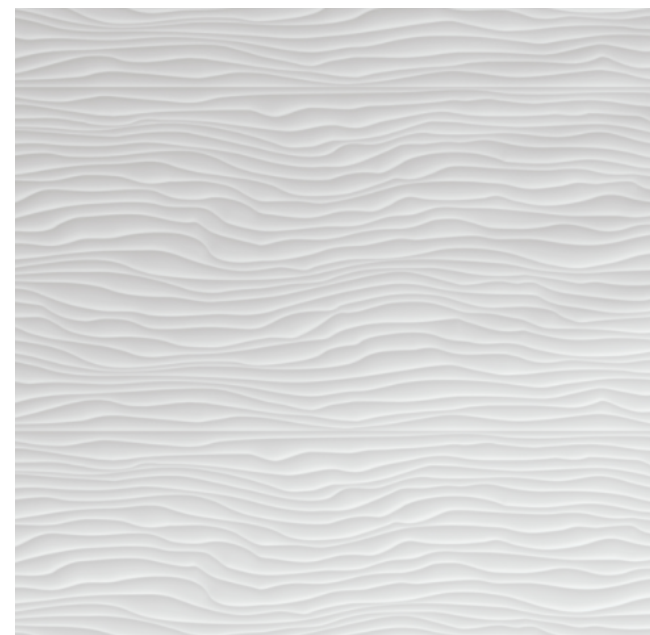
Tissue White 16"x48" R

A series that speaks for itself. With its wavy, organic reliefs and its white matte finish, Tissue is the perfect choice to bring continuity and elegance to your next project.