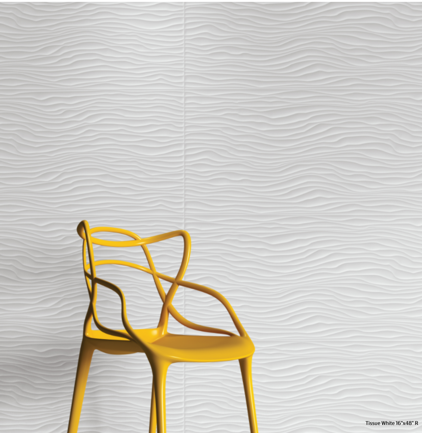
Tissue White 16"x48" R