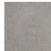
Cinza 24"x24" R PO - I67180030 UP - I67180026