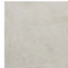
Blanco 35\"x35\" R PO - I67170020 UP - I67170022