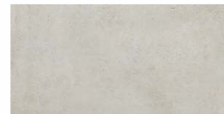
Blanco 24\"x48\" R PO - I67170032 UP - I67170034