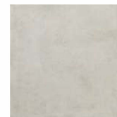
Blanco 24\"x24\" R PO - I67170030 UP - I67170026