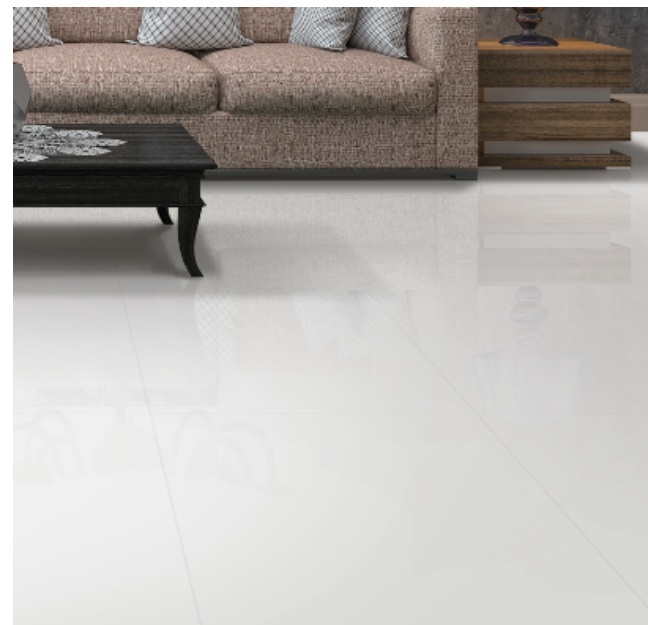
Crystal White 24"X48" R PO

A white polished porcelain that will add purity and elegance to your spaces through the simplicity of its color and the dazzle of its bright finish.