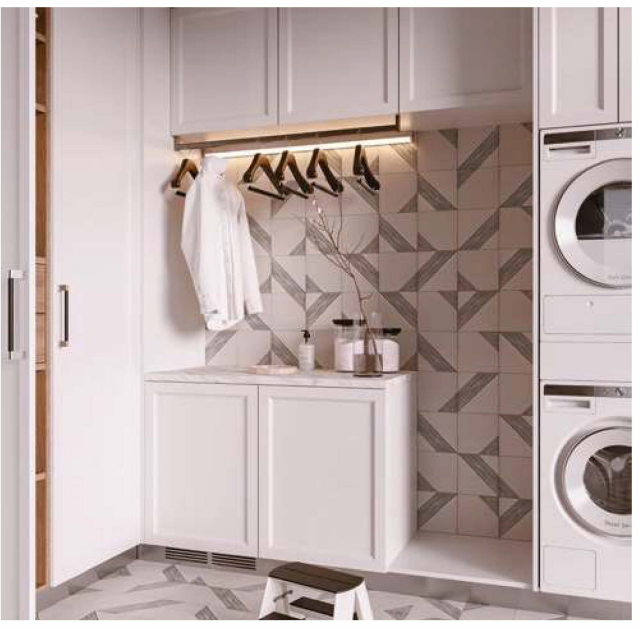
Tribe Ivory Diamond & Lines 8"x8"

Inspired by tribal prints, this series provides a wide range of patterns that can be played around with to obtain a space that is out of the box, using cool tones that are easy to combine.