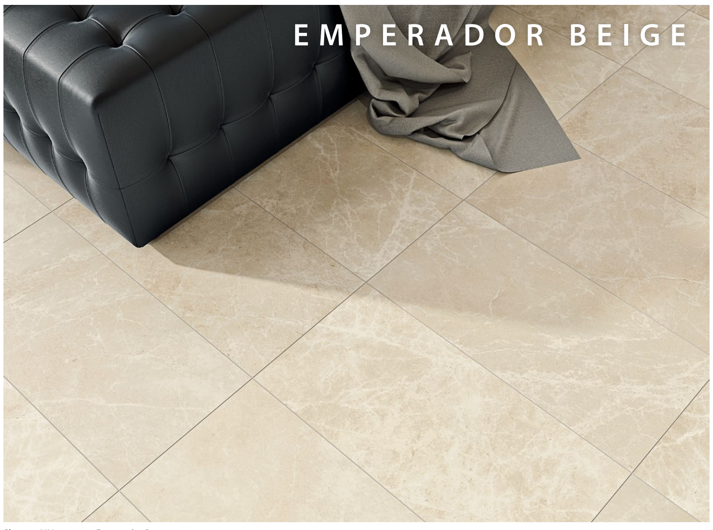
Shown: AIN20 12x24 Emperador Beige