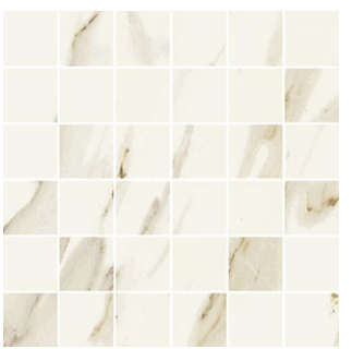
AIN10/M122 Calacatta Gold mosaic