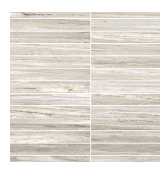
AIN30/M1x6STK Zebrino Taupe Stack mosaic