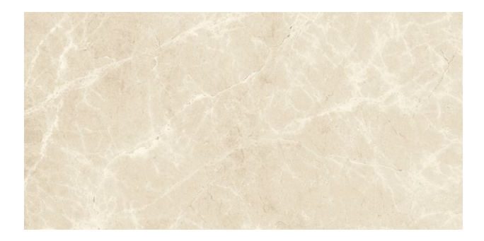
AIN20 12x24 Emperador Beige