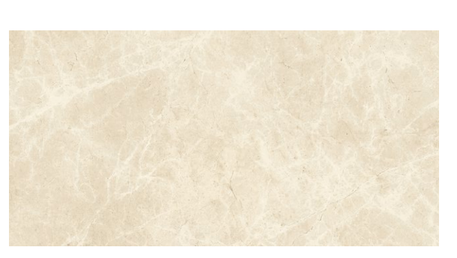
AIN2W 12.1x24.4 Emperador Beige (ceramic)