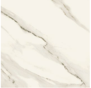
AIN10 12x12 Calacatta Gold