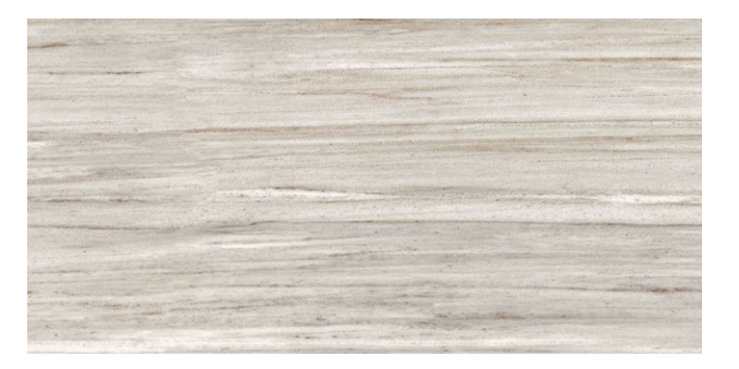
AIN30 12x24 Zebrino Taupe