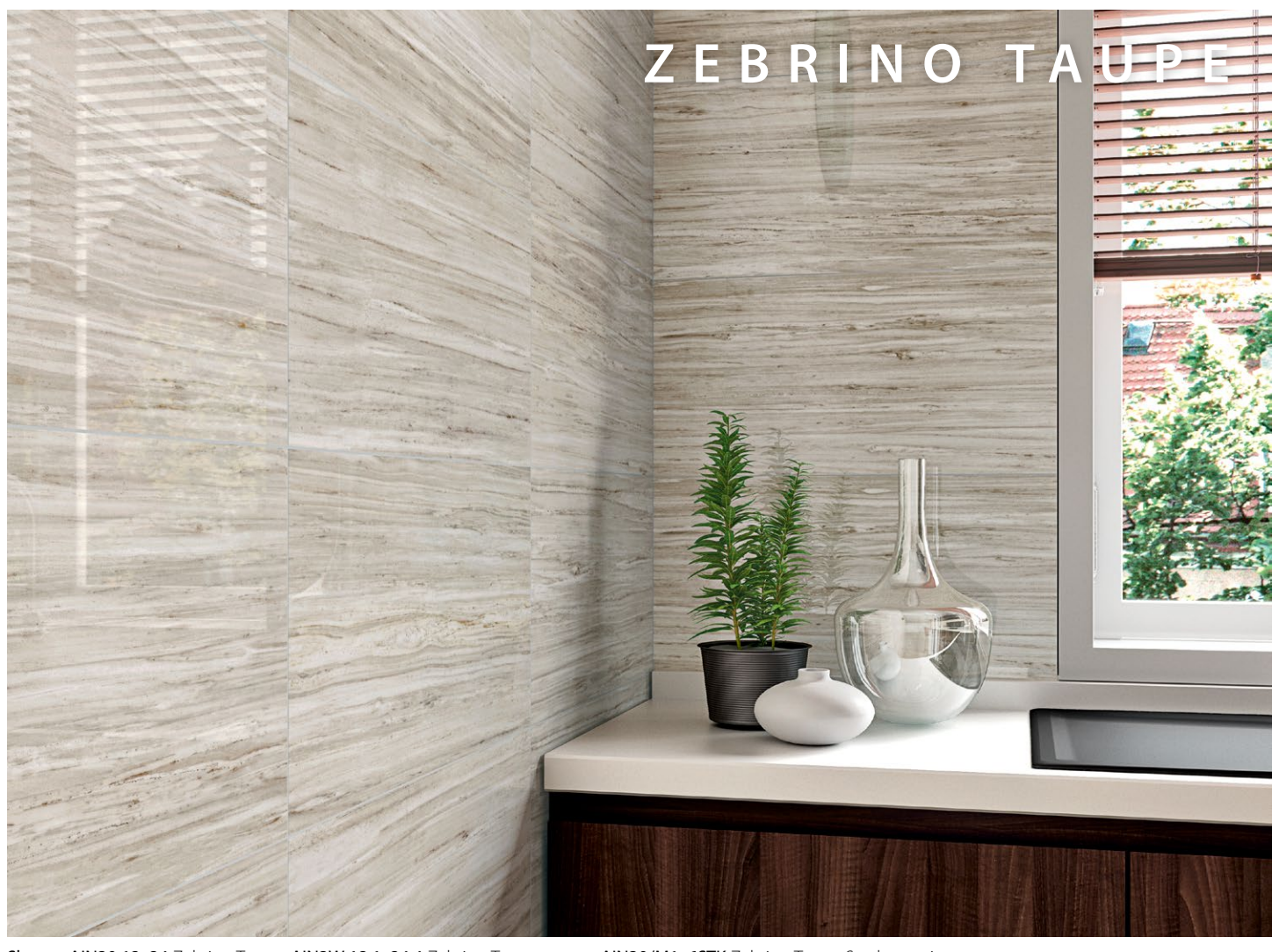
Shown: AIN30 12x24 Zebrino Taupe, AIN3W 12.1x24.4 Zebrino Taupe (ceramic), AIN30/M1x6STK Zebrino Taupe Stack mosaic