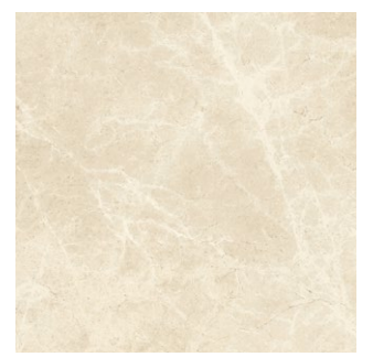
AIN20 12x12 Emperador Beige