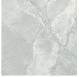
AIN40 12x12 Breccia Mist