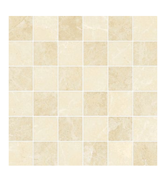
AIN20/M122 Emperador Beige mosaic