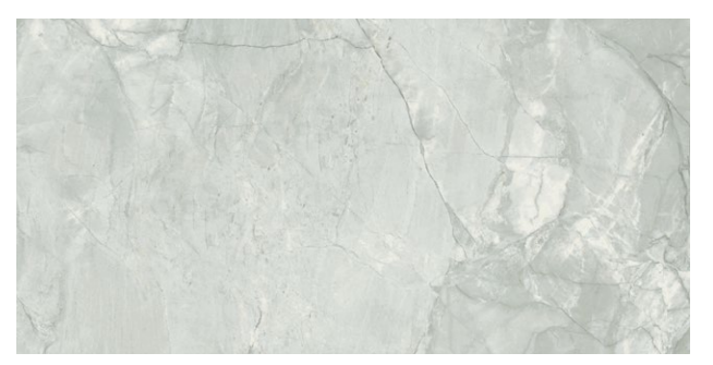
AIN40 12x24 Breccia Mist