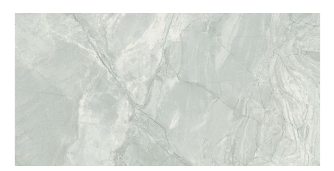
AIN4W 12.1x24.4 Breccia Mist (ceramic)