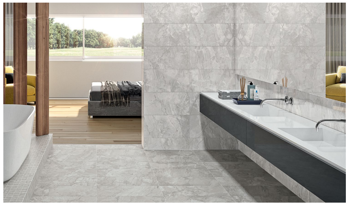
Shown: AIN40 12x24 Breccia Mist, AIN4W 12.1x24.4 Breccia Mist (ceramic), AIN40/M122 Breccia Mist mosaic

Classic designs paired elegantly with modern formats make Florida Tile's Ainslee Park<sup>HDP</sup> the perfect option for today's easy eclectic spaces. Marble looks feature bold graphics that allow each color to be a standout in the crowded world of interior decor. Glossy ceramic wall and matte porcelain floor tile coordinate beautifully to allow for a continuous design theme throughout any space.