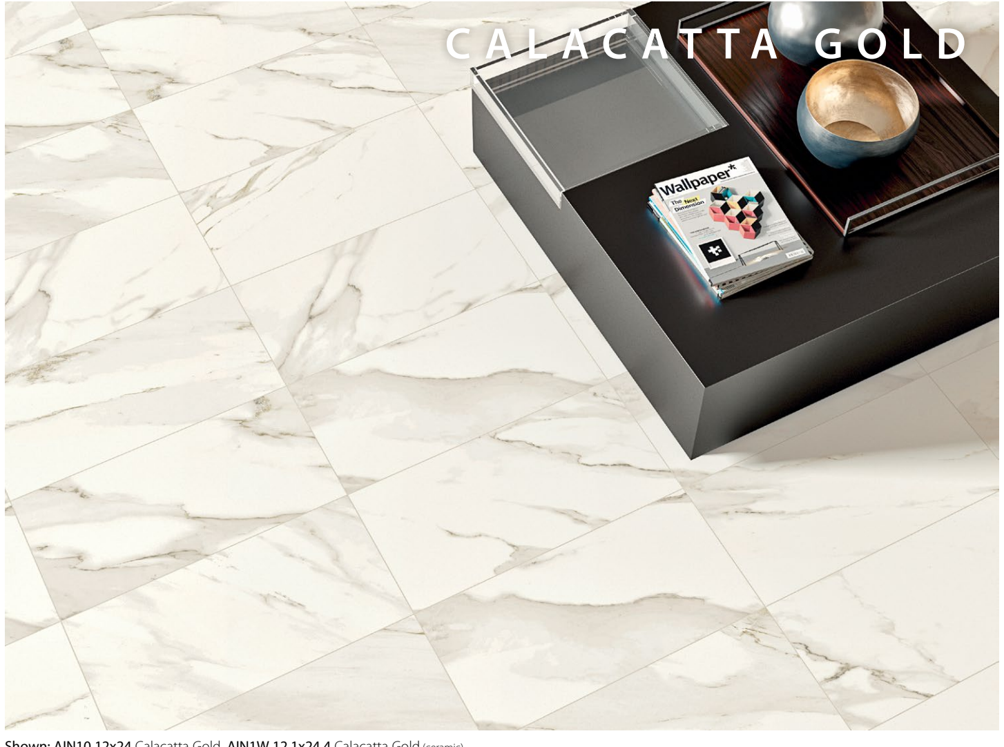
Shown: AIN10 12x24 Calacatta Gold, AIN1W 12.1x24.4 Calacatta Gold (ceramic)