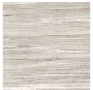
AIN30 12x12 Zebrino Taupe