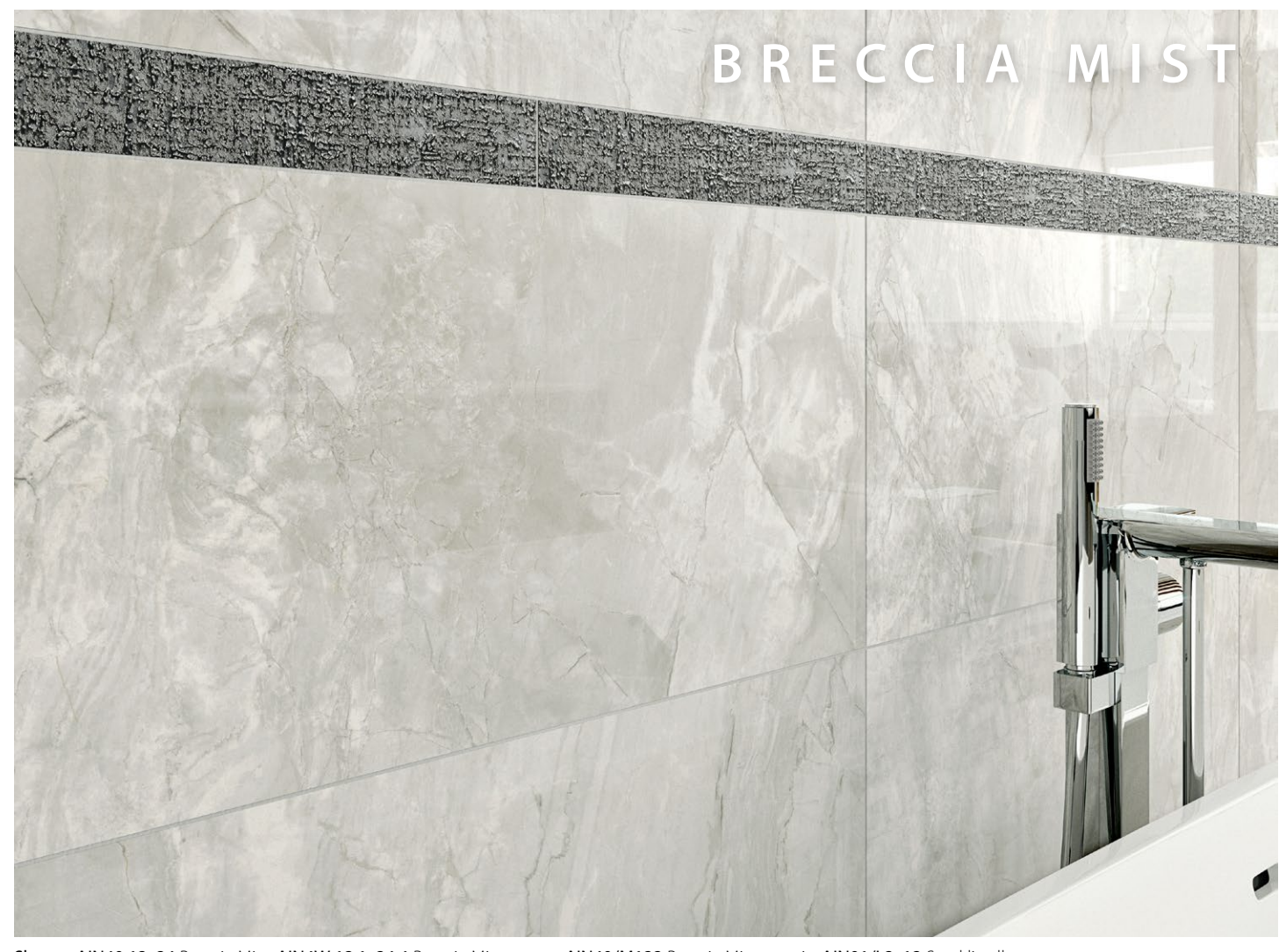
Shown: AIN40 12x24 Breccia Mist, AIN4W 12.1x24.4 Breccia Mist (ceramic), AIN40/M122 Breccia Mist mosaic, AIN01/L2x12 Steel listello