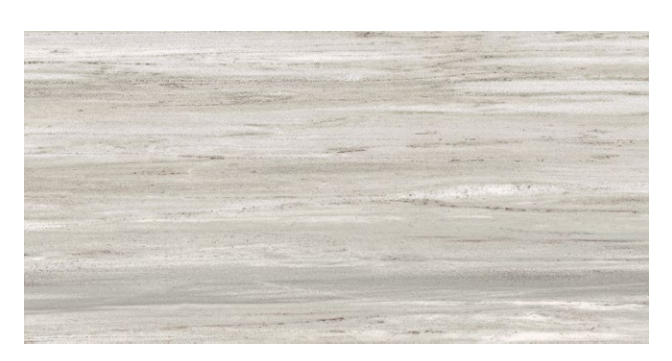
AIN3W 12.1x24.4 Zebrino Taupe (ceramic)