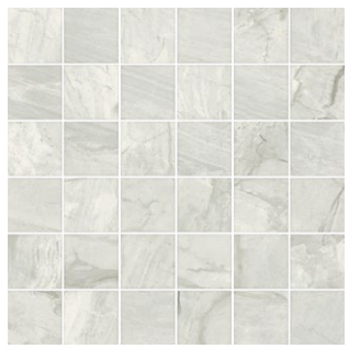
AIN40/M122 Breccia Mist mosaic