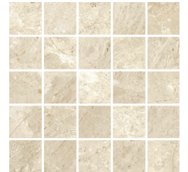
89204/M12 Eggshell mosaic