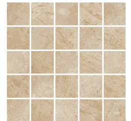
89233/M12 Wicker mosaic