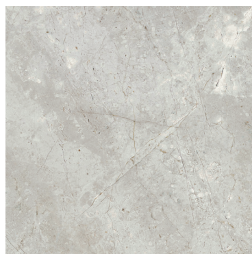
89214 18x18 Pumice