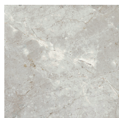
89214 12x12 Pumice