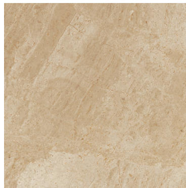
89233 18x18 Wicker