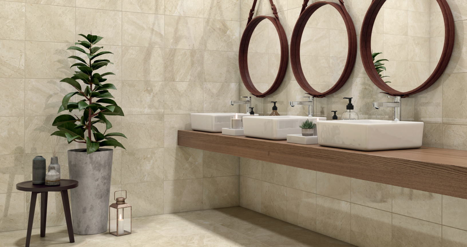
Shown: 89204 18x18 Eggshell, 89204 10x13 Eggshell (ceramic)