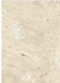
89204 10x13 Eggshell (ceramic)