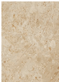
89233 10x13 Wicker (ceramic)