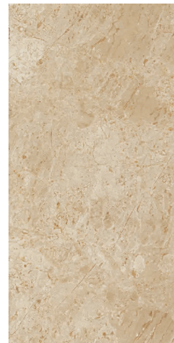
89233 12x24 Wicker