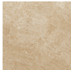
89233 12x12 Wicker