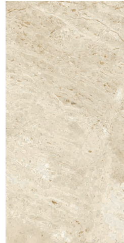
89204 12x24 Eggshell