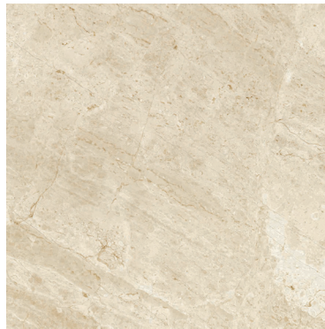
89204 18x18 Eggshell