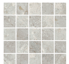
89214/M12 Pumice mosaic