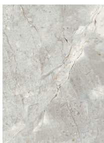
89214 10x13 Pumice (ceramic)