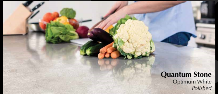
Quantum Stone Optimum White Polished