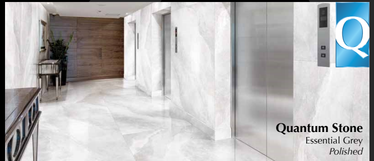
Quantum Stone Essential Grey Polished