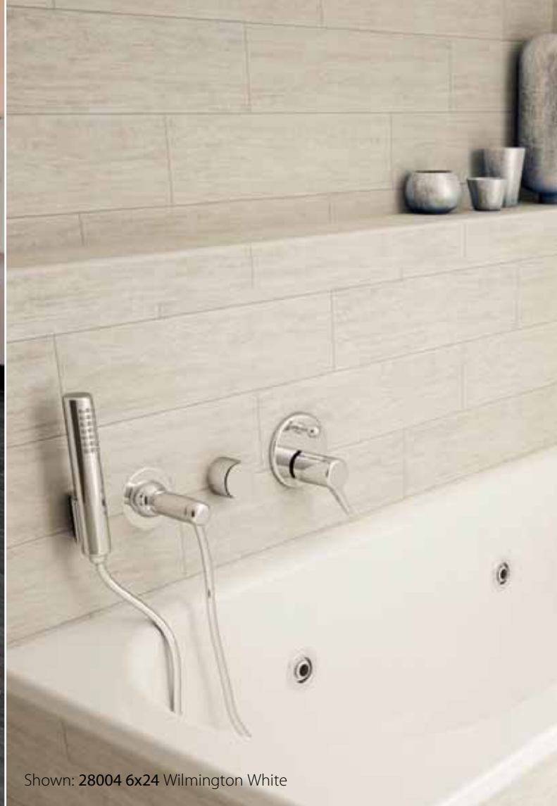
Shown: 28004 6x24 Wilmington White