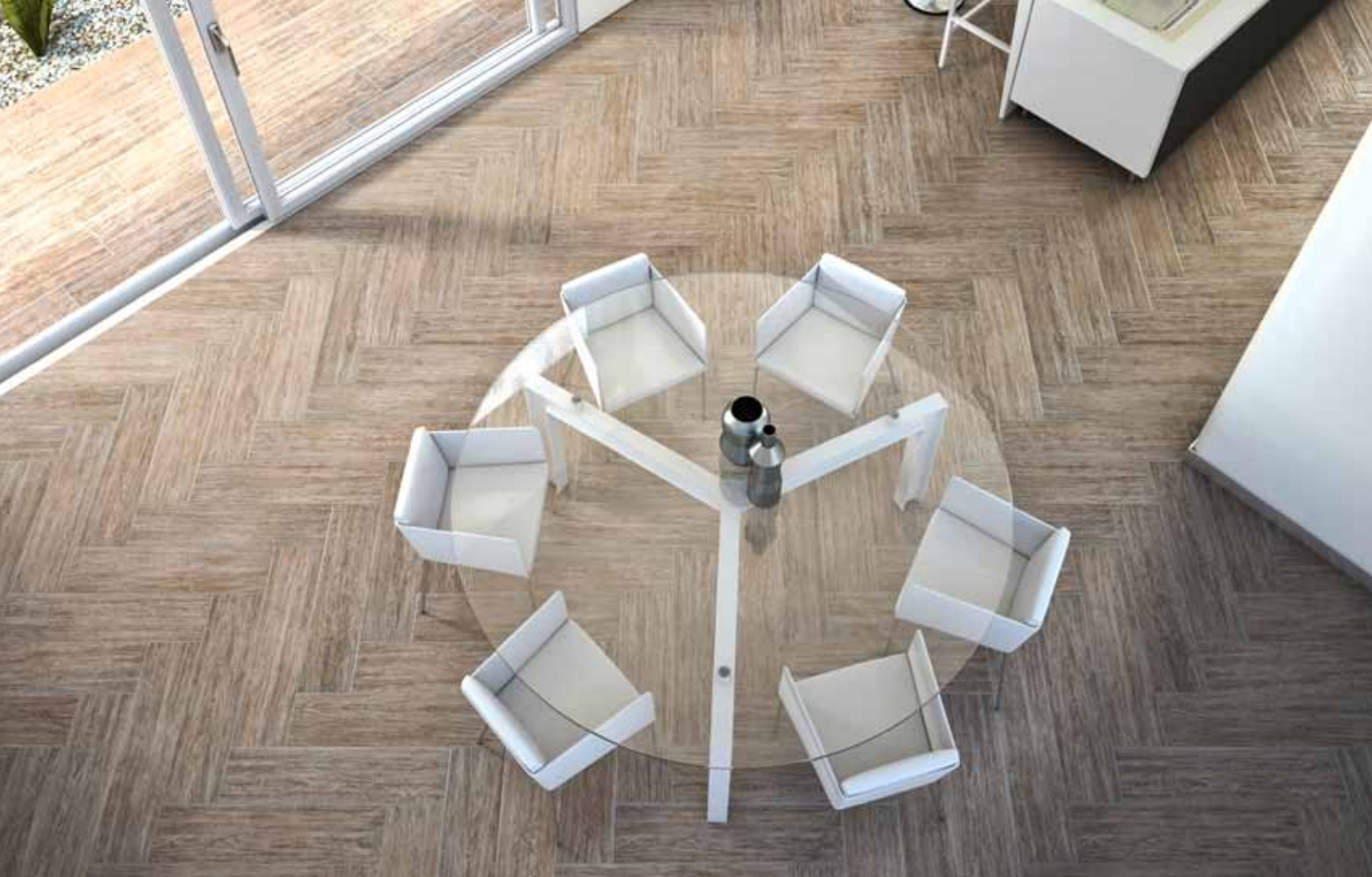
Shown: 28092 6x24 Charleston Brown