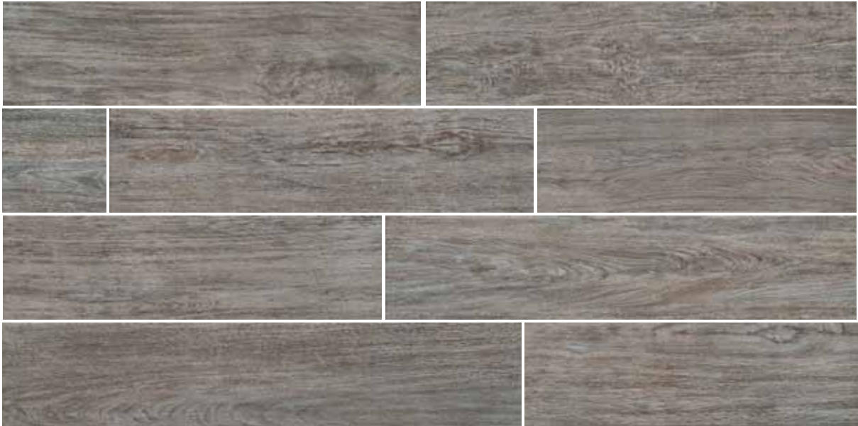
28060 6x24 Newport Blue