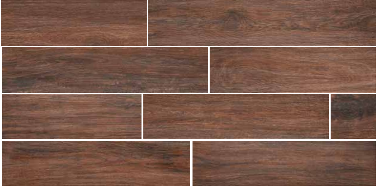
28088 6x24 Cayman Red