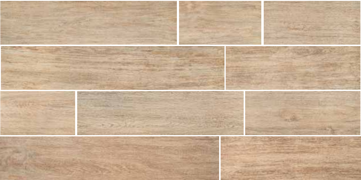
28034 6x24 Hampton Blonde