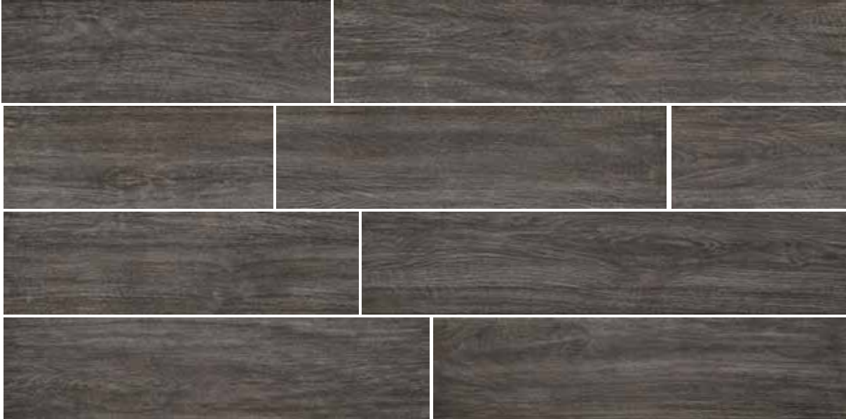
28017 6x24 Cape Cod Charcoal