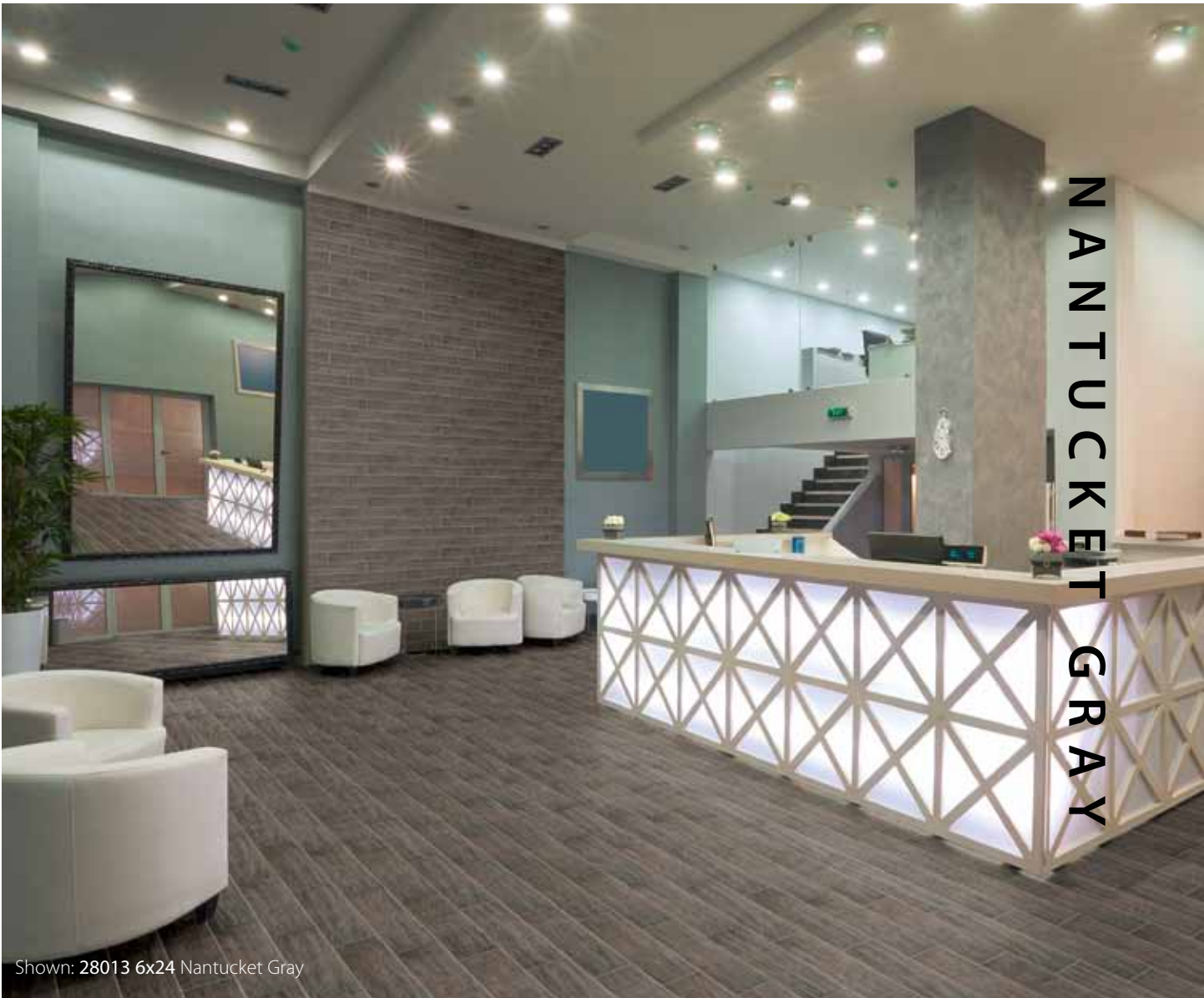
Shown: 28013 6x24 Nantucket Gray