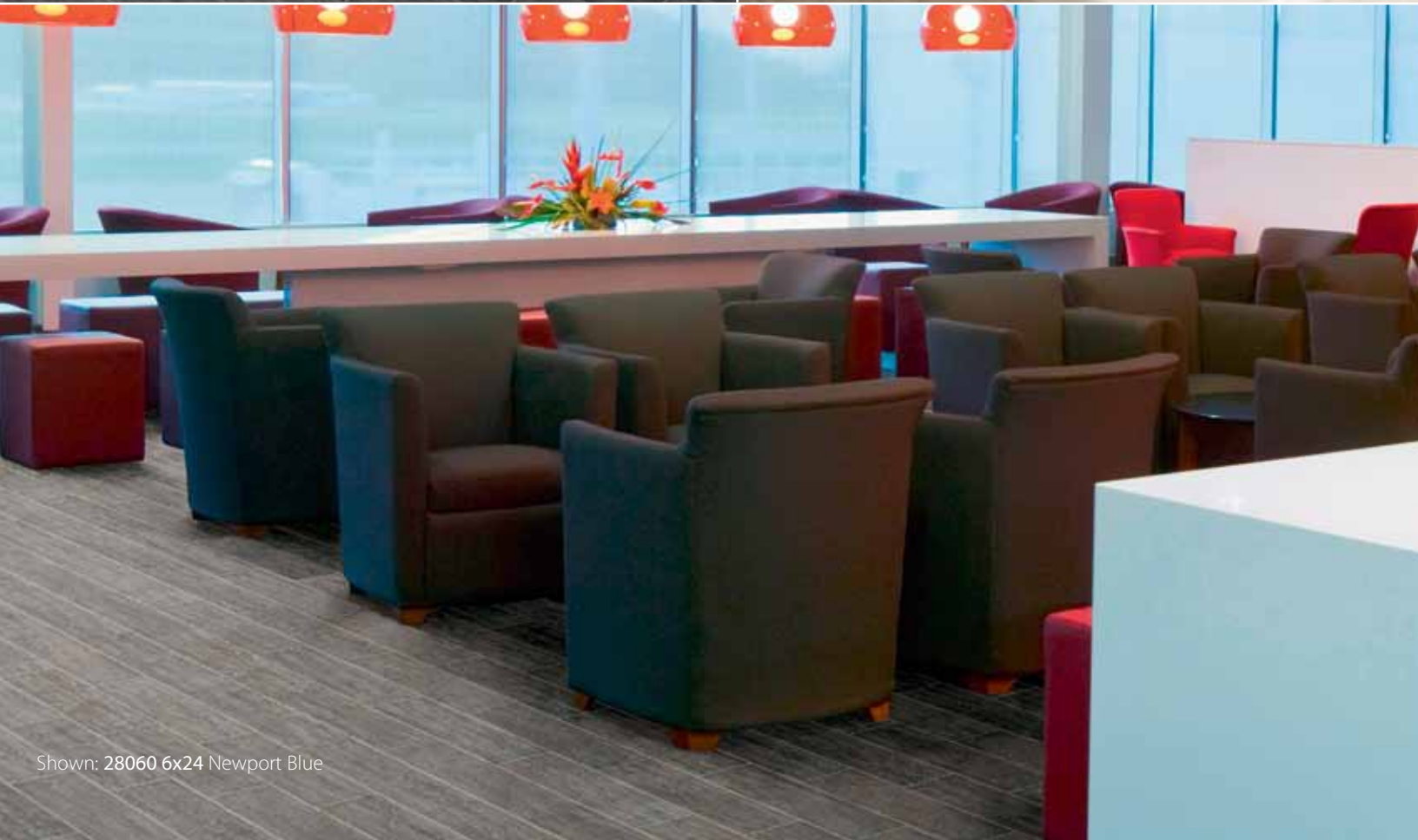
Shown: 28060 6x24 Newport Blue