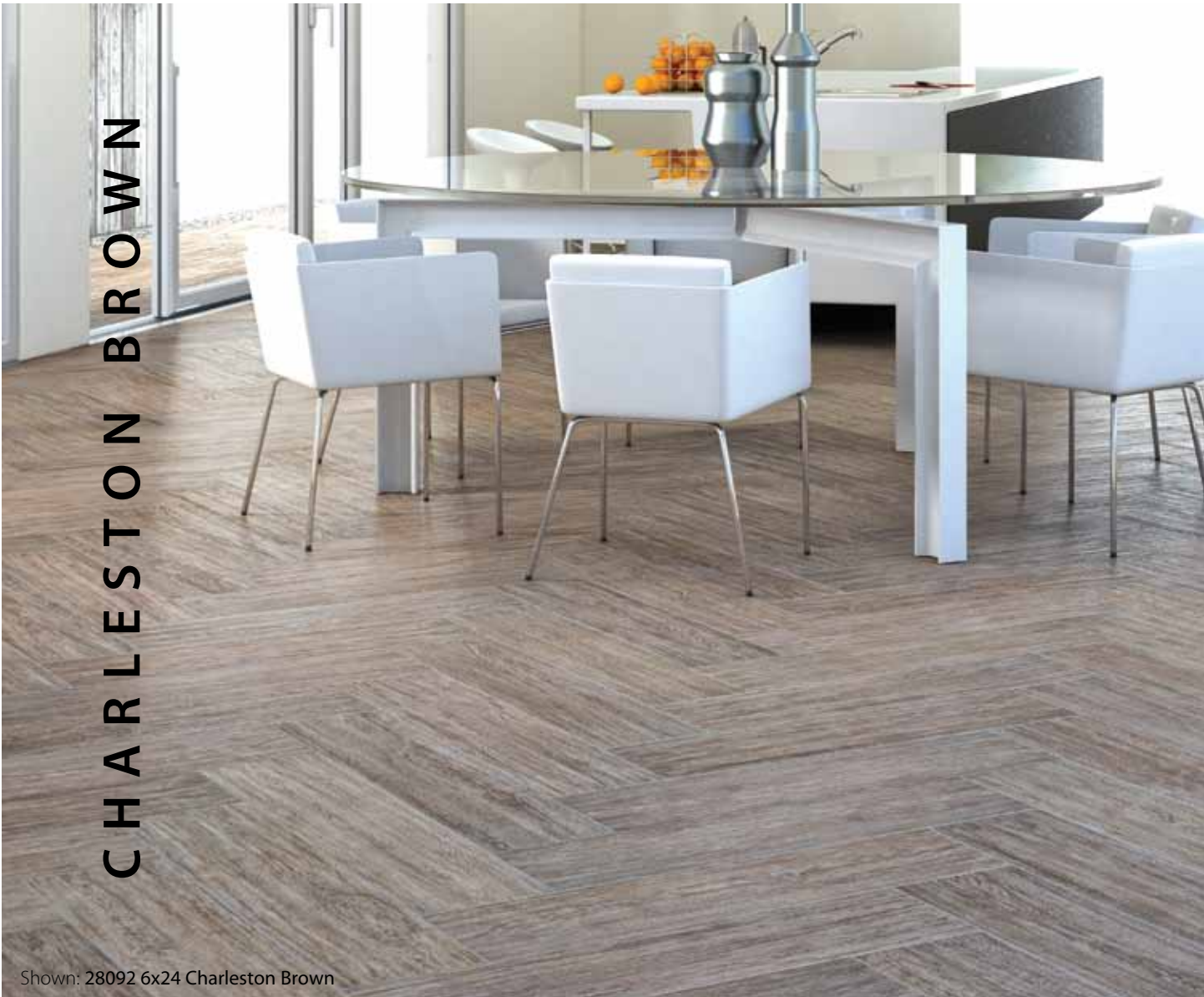
Shown: 28092 6x24 Charleston Brown