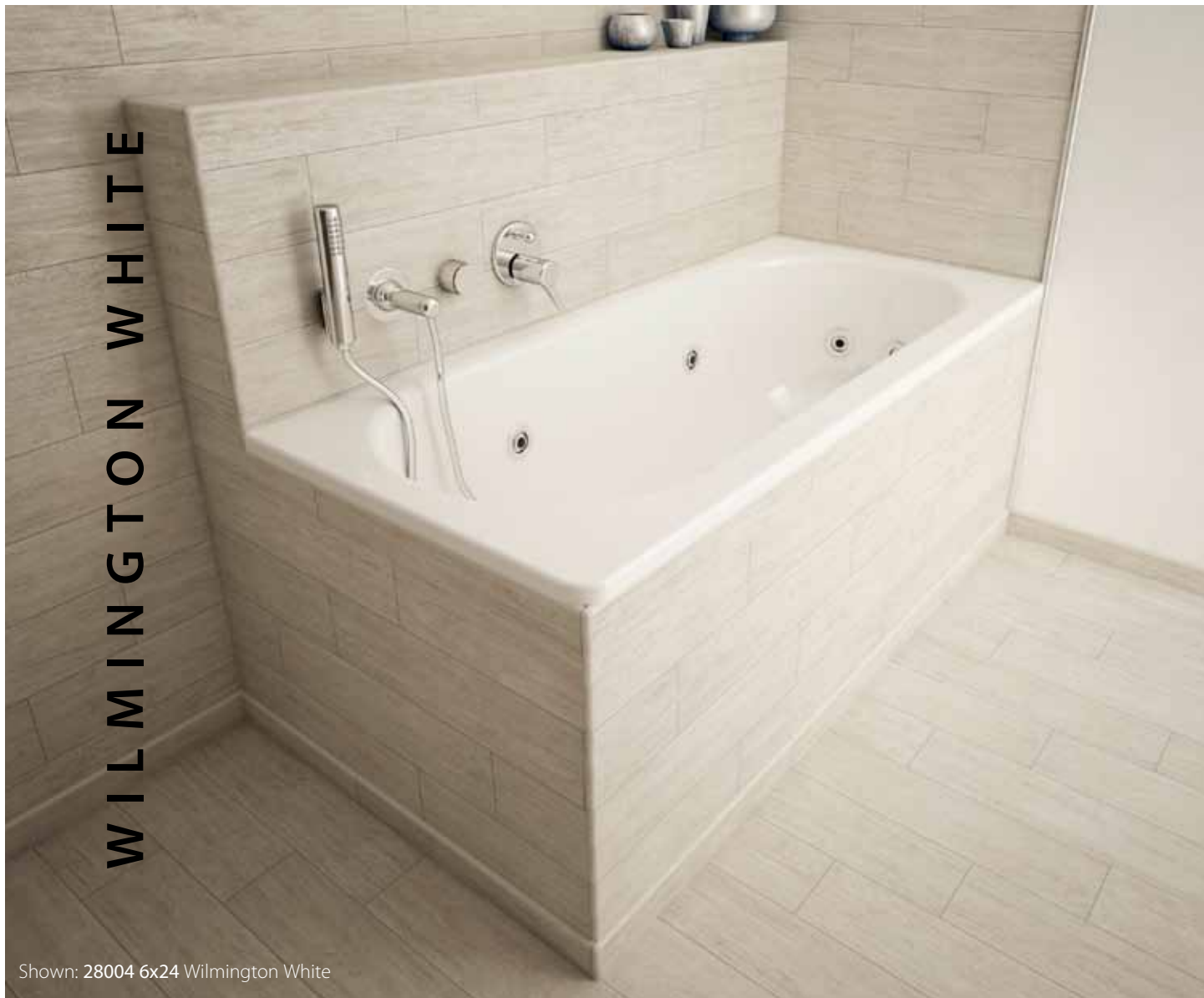
Shown: 28004 6x24 Wilmington White