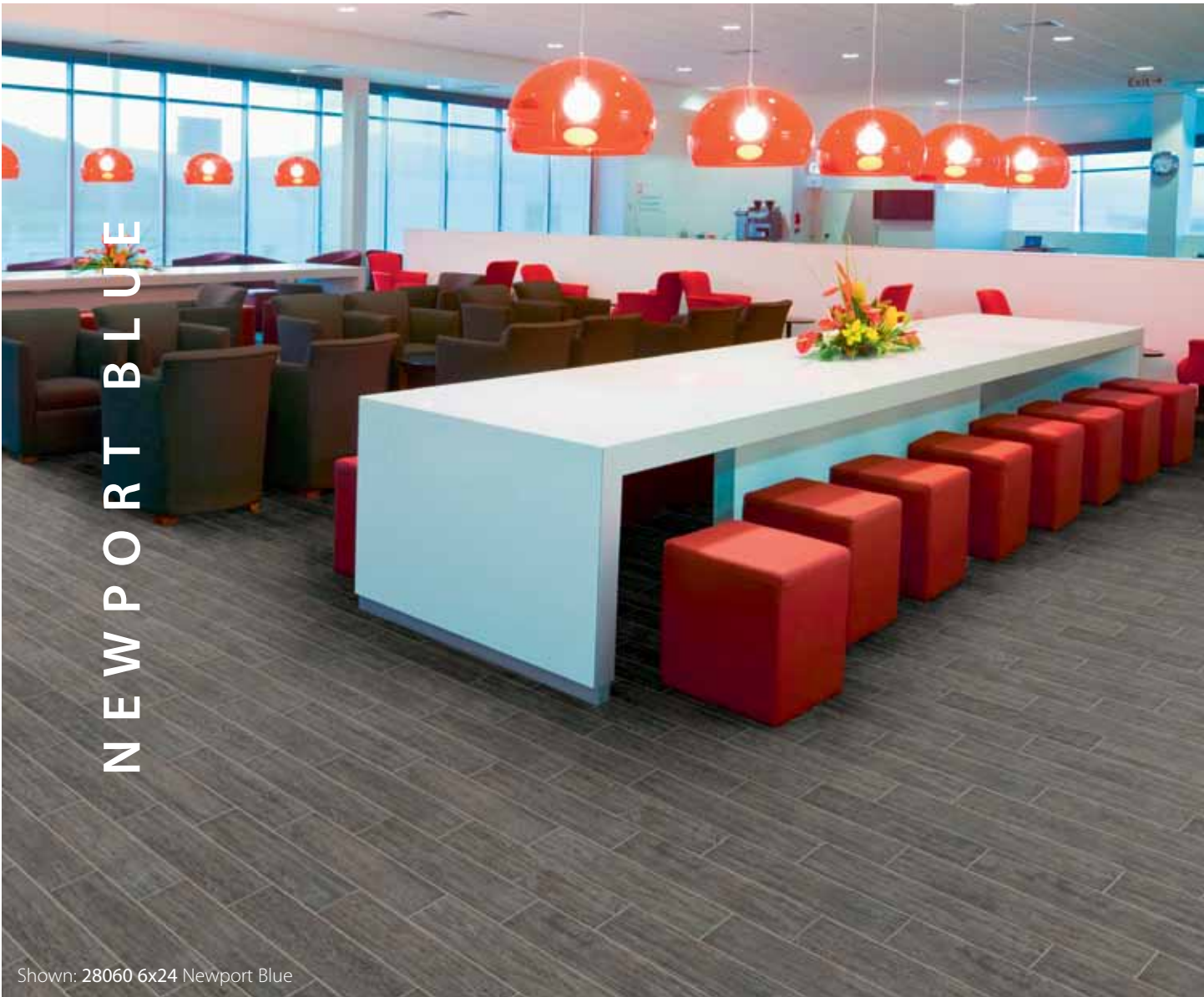
Shown: 28060 6x24 Newport Blue