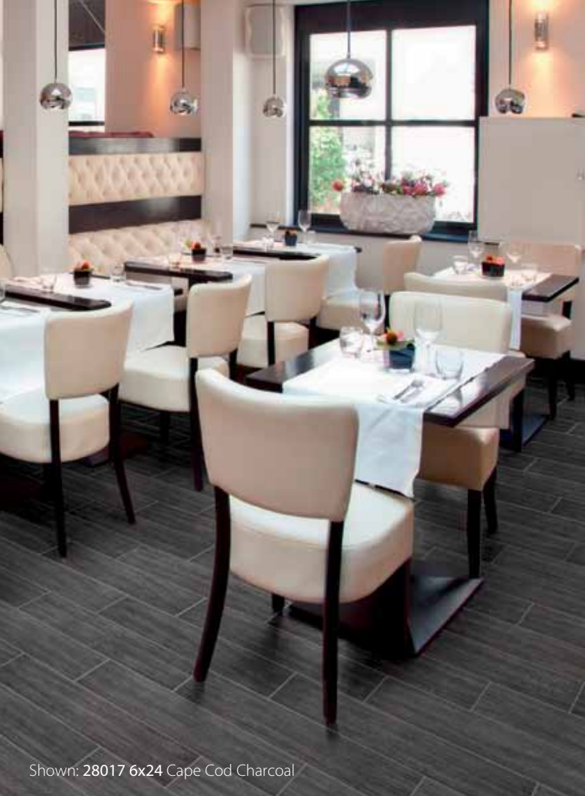
Shown: 28017 6x24 Cape Cod Charcoal