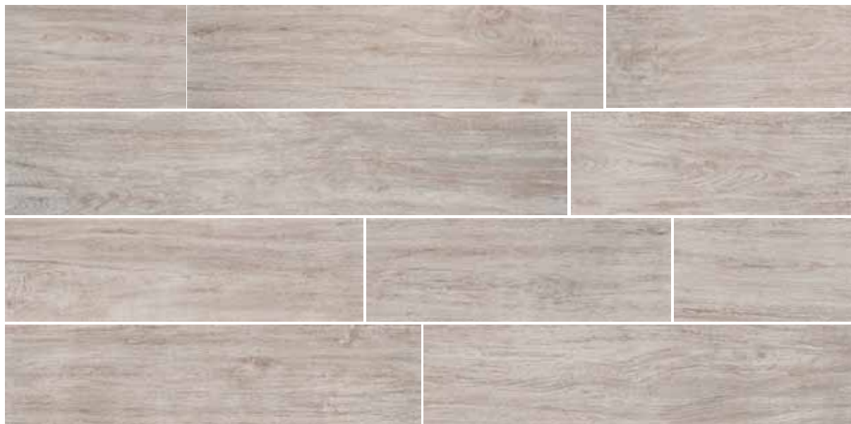
28004 6x24 Wilmington White