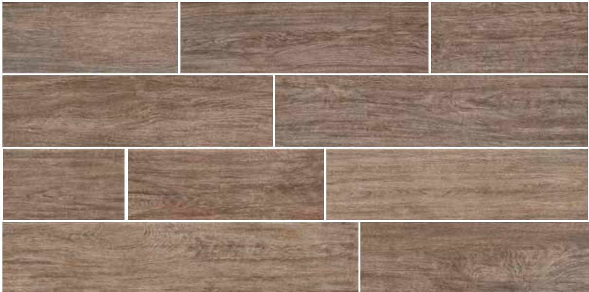
28092 6x24 Charleston Brown