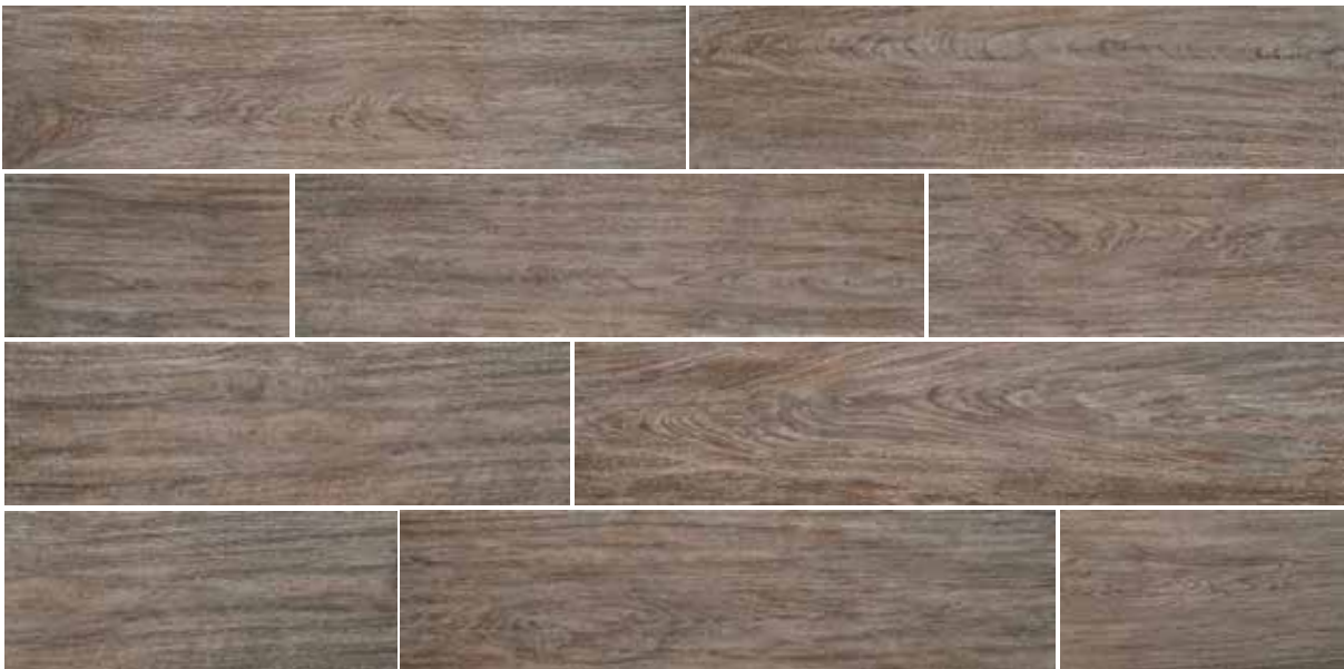
28013 6x24 Nantucket Gray