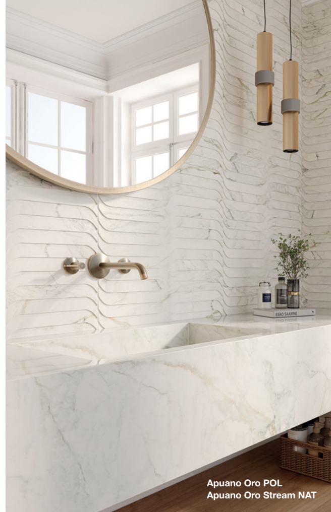
Apuano Oro POL Apuano Oro Stream NAT