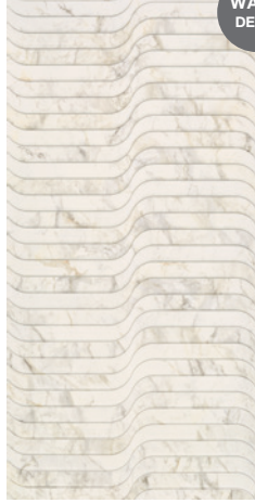
Apuano Oro Stream | V2

Single Bullnose 3x12 NAT RECT | #80152ET 3x12 POL RECT | #80190ET